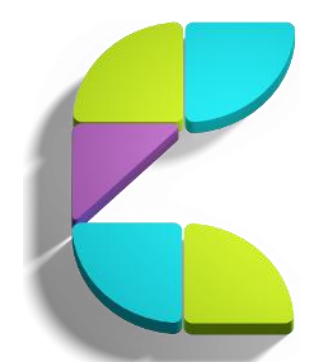
CIVIC Computing (UK) – an Edinburgh-based digital agency and project coordinator